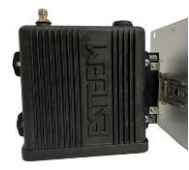
Enclosure Installation - DIN Mount Option

ESTeem Industrial MESH improves Uptime by adding Redundancy to your Networks, included in all Horizon Radios