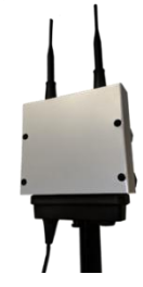
Direct NEMA 4 Installation - Pole Mount Option